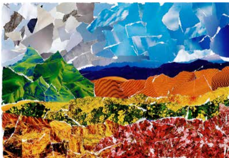
Artwork by Husnaa Mota - 9A