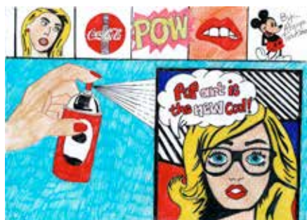
Artwork by Atqiya Tasnima - 9B