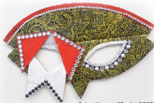
Saima Hussain 9D - Art GCSE